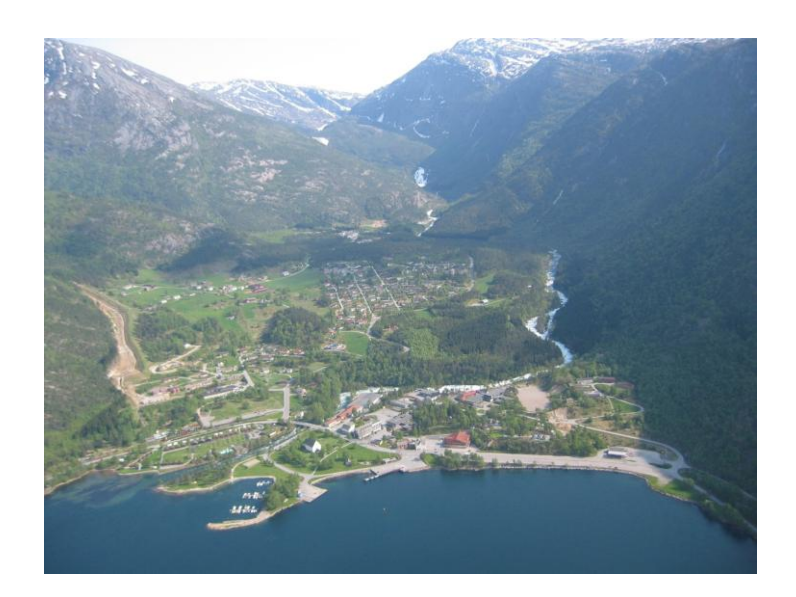
Fig. 2 - Kinsarvik located at the mouth of the Sørfjorden and the Eidfjorden where it branches from the Hardangerfjord, county of Hordaland, Norway.