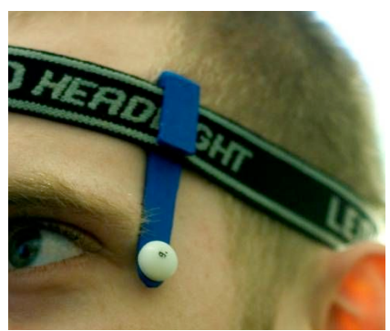
Figure 2. Eye-lens dosemeter

Increased evidence of radiation-related lens opacities in interventional radiologists has been reported in recent years [2]. However, the eye lens doses are never measured in routine procedures and, at the present time, there is a lack of methods to measure such doses. At the moment, a protocol to calculate and reproduce the operational quantity, personal dose equivalent at a depth of 3 mm of tissue, H_{p}(3,\alpha) , in calibration laboratories has been developed and a set of conversion coefficients from air kerma to H_p(3,\alpha) has been proposed [3]. In addition, on the basis of the computed quantities, a dosemeter prototype, optimized to respond in terms of H_p(3) is under development by RADCARD. Figure 2 shows one of the prototypes. The overall procedure is also supported with type test irradiations carried out at the Laboratoire National Henri Becquerel, CEA Saclay.