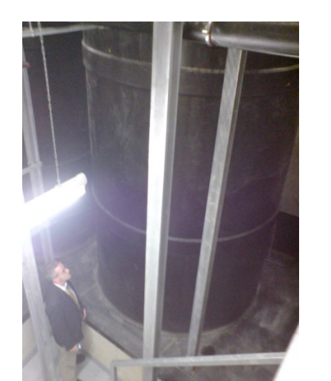
Holding tanks in a hospital in Luxembourg

In 2002 Ireland submitted its national report to the meeting of the Oslo-Paris (OSPAR) ad-hoc working group on Radioactive Substances (RSC) describing how it intended to implement its strategy with regard to the discharge of radioactive substances to the marine environment. In assisting the Department of the Environment, Heritage and Local Government (DEHLG) in preparing Ireland's submission to OSPAR the Radiological Protection Institute of Ireland (RPII) carried out a comprehensive review of the use of unsealed radioactive sources across all sectors throughout Ireland. The discharge of iodine-131 through patient excreta, arising as a result of activities administered to patients undergoing thyroid ablation treatments, was identified as one of the contributors to the total activity of unsealed radionuclides discharged the to marine environment from Ireland each year. In reviewing the use of unsealed radioactive sources in the medical sector the RPII determined that it would need to review its own regulatory requirements in relation to the installation of sewage holding tanks in hospitals. These tanks would take waste from the iodine ablation suites and store it for a number of weeks to allow for the decay of iodine-131 prior to discharge to the sewers. This action was subsequently included in the set of intermediate goals Ireland would take to implement the OSPAR strategy.