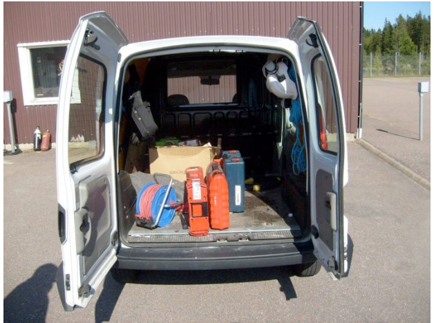
Figure 1. The contaminated car

The incident was reported to the competent authority as soon as possible. It has by the NPP been judged to be outside the INES scale.