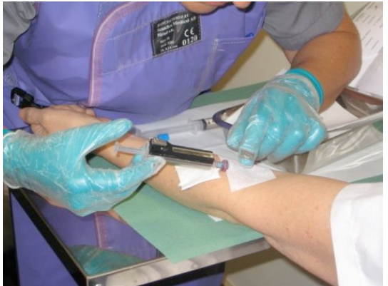
Figure 4. Radiopharmaceutical administration in nuclear medicine

exceeded. The final analysis of the results should provide information on the real doses to nuclear medicine workers and help to identify the best practices in this field.